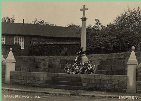
The Memorial pictured in about 1920

The Parish Council is now working with Bradford Council to get estimates for repairs and then to apply for grants for the work.